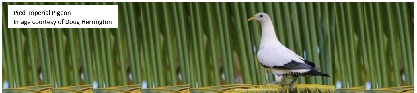
Pied Imperial Pigeon